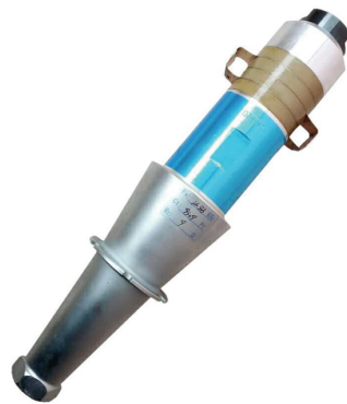
Figure 2. The picture of transducer

transducer is coupled to the surface of the measured structure parallel to the axis of the borehole for paired measurement and oblique measurement. This method is suitable for the concrete structure with small section size or no more boreholes.