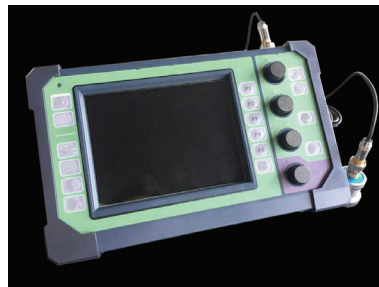
Figure 3. The picture of Instrument for nondestructive testing