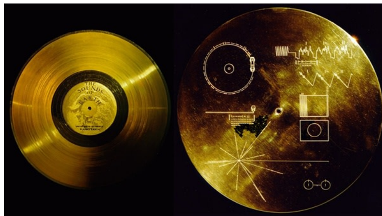
Figure 2. The golden record carried on Voyager spacecraft

Next, the New Horizons Mission to Pluto launched in 2006 carried human artefacts including an American flag and most surprisingly the ashes of Clyde Tombaugh, the American astronomer who discovered Pluto in 1930! What a shipwrecked alien coming upon such junk will make of all this is unimaginable! Perhaps William Wordsworth in this Psalm of Life said it all. What we should aim at leaving is more explicitly our intellectual cultural footprints in some indelible, and hopefully universal way, in the “sands of time”.